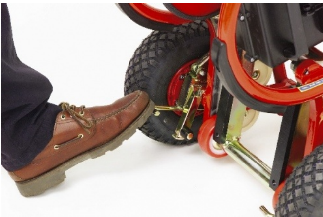
Push by foot