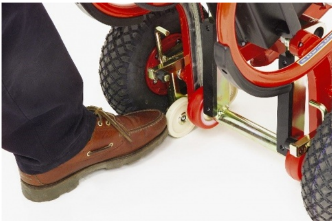
Push the back wheel of the brake forward