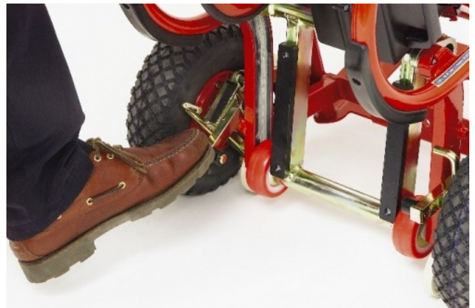
Turning further by foot or hand to neutral position.

(Then the middle wheel of the 3 brake wheels is stopped by a cam on the frame- when turning the brake anti- clockwise.)