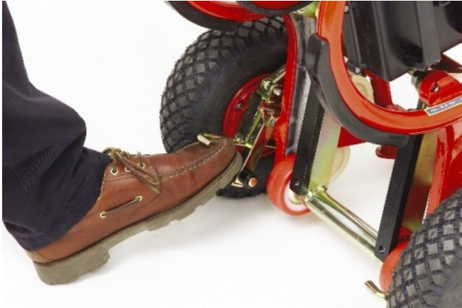
Push up the handle