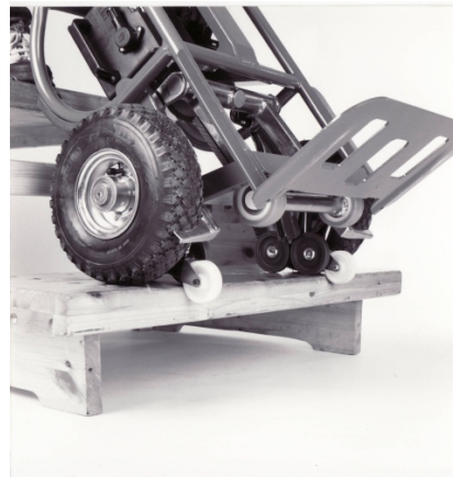
LIFTKAR braked at the step margin