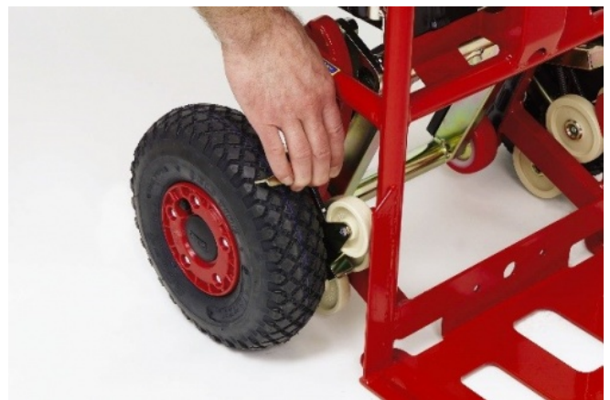
... or by hand