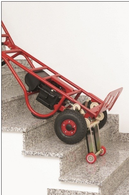
Stop position at the stair